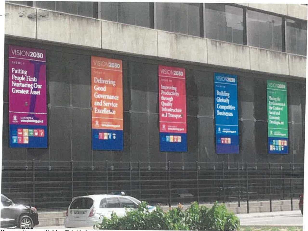
Picture of posters linking Trinidad and Tobago's National Framework, Vision 2030 and the UN Sustainable Development Goals, at the Eric Williams Financial Complex in the capital city, Port of Spain.

Office of the Prime Minister (Gender and Child Affairs) Beijing + 25 Report October 2019