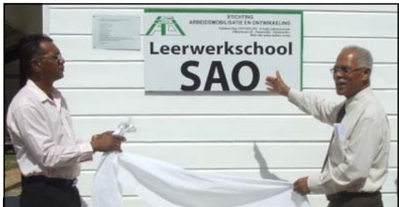
Completion of a classroom in Fort New Amsterdam, November 2011