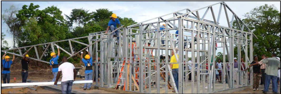
Start of the Nationwide Housing Program, August 2011